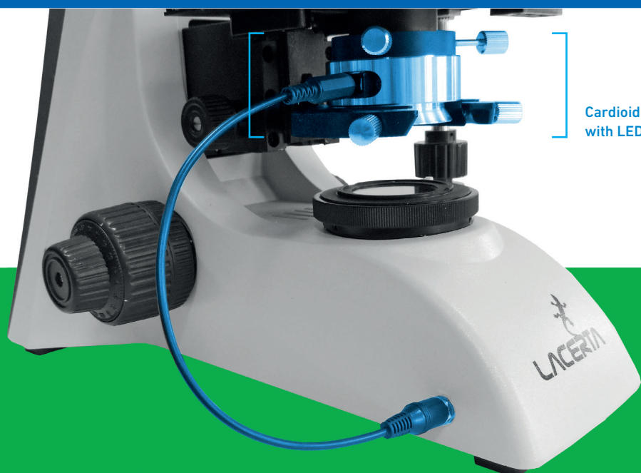
Cardioid Dark Field with LED illumination